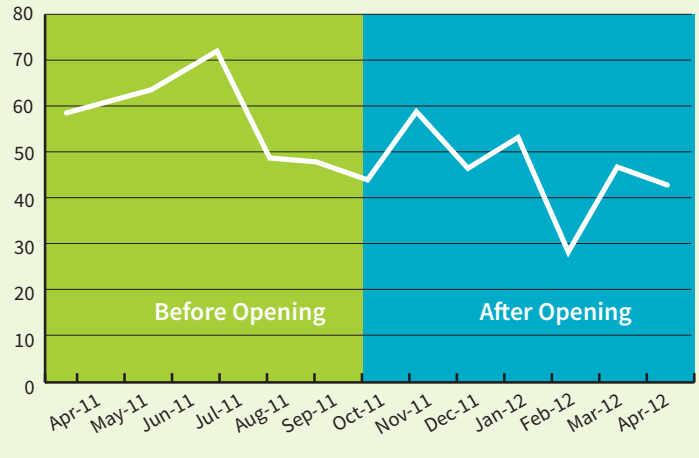
Figure 2: Number of Calls to Police in the Timber Grove, (Coast Mental Health) Neighbourhood Before and After Site Opening

In the six months before Coast Mental Health opened Timber Grove, there were 351 calls to the police. In the six months after project opening, the call number dropped to 273.