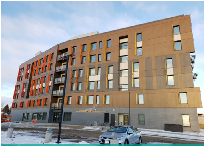
The Fort St John Multi-Family Passive House, certified to Passive House standards.