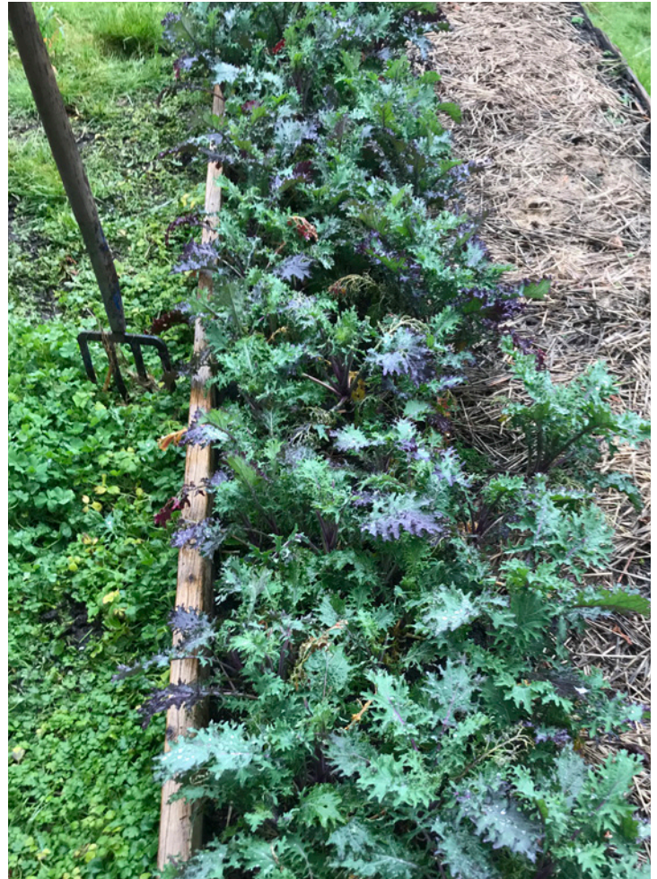
Urban vegetable garden maintained as part of the BC Housing Peoples, Plants and Homes program