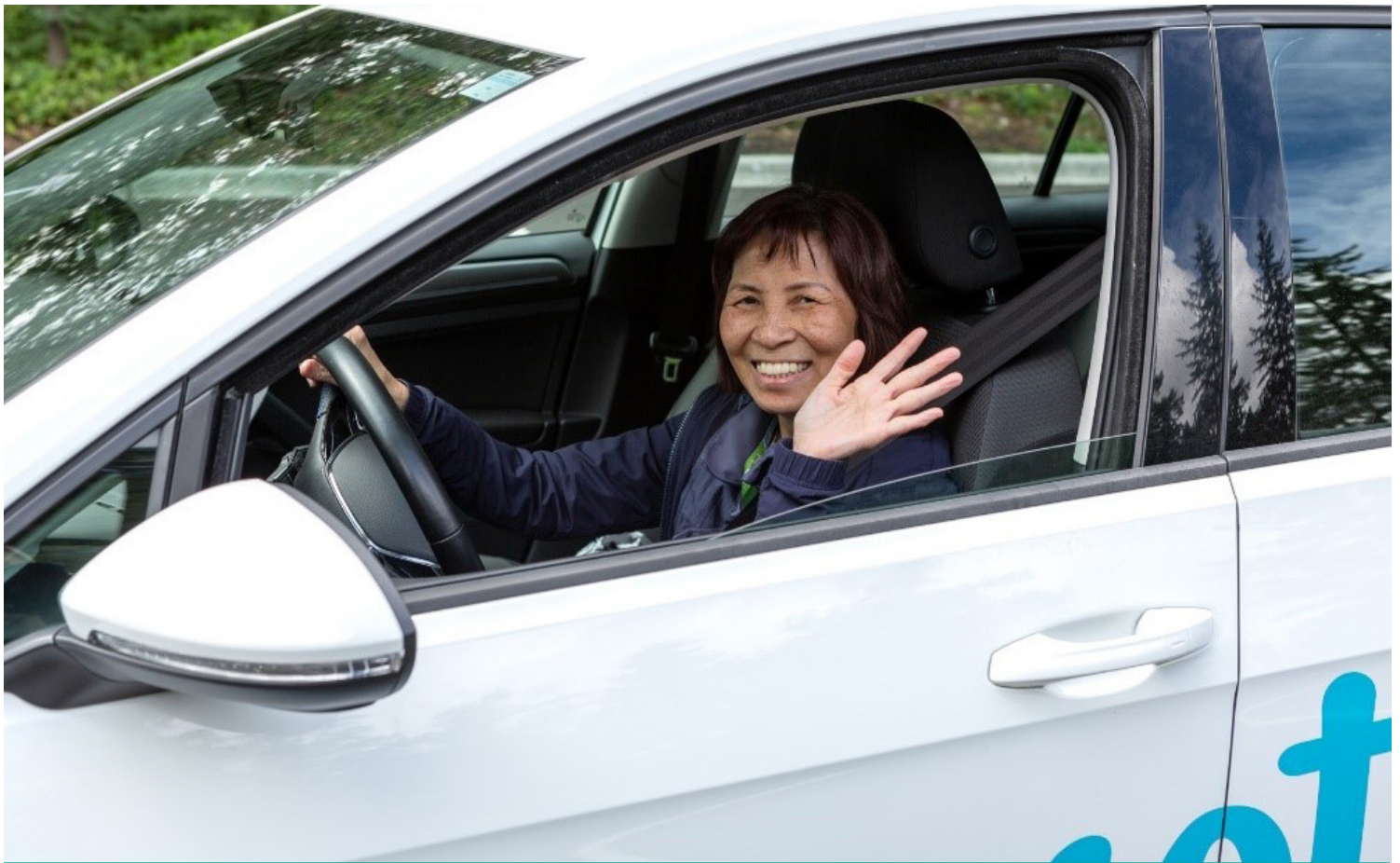
A BC Housing staff member test drives an electric vehicle.