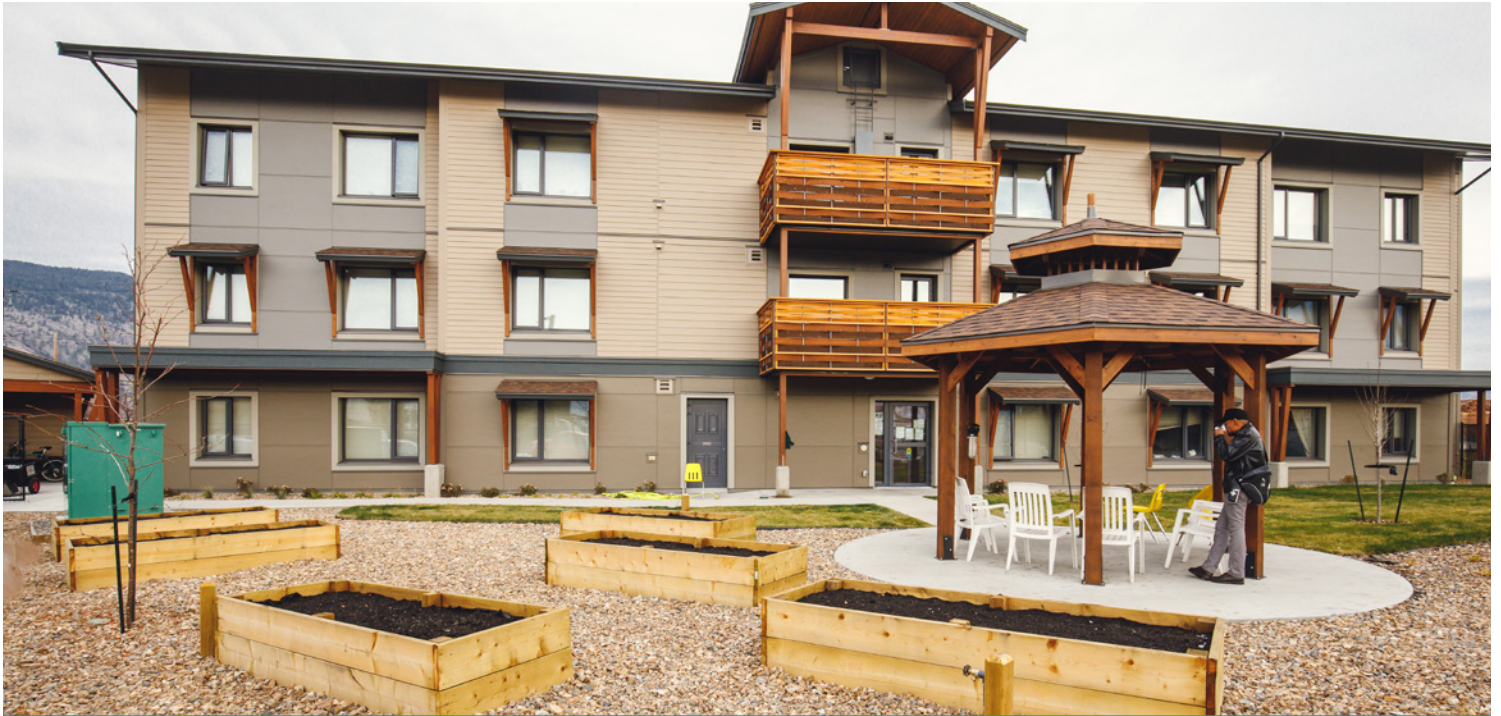
Juniper House in Merritt, certified to the International Passive House standard.