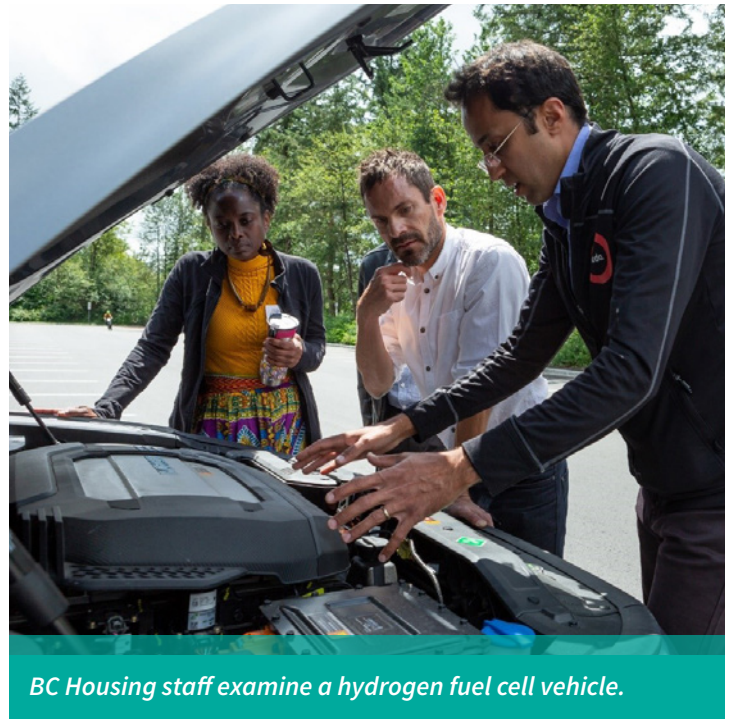
BC Housing staff examine a hydrogen fuel cell vehicle.