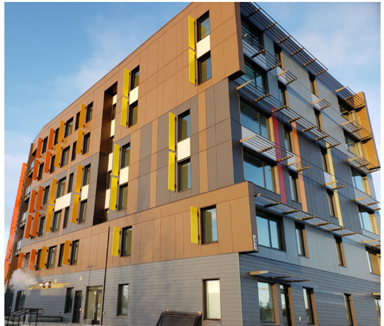
The Fort St John Multi-Family Passive House, providing affordable rental housing in the community.

For the 2019 reporting year, FortisBC natural gas consumption data (accounting for approximately 23% of our total emissions) was estimated for private accounts for all or varying portions of individual buildings. For the 2019 reporting year, we are estimating consumption of these accounts based on similar building types to ensure consistency year-to-year. This is a significant issue which has limited our ability to conduct accurate data analysis and checks that would result in a high level of confidence in this data.