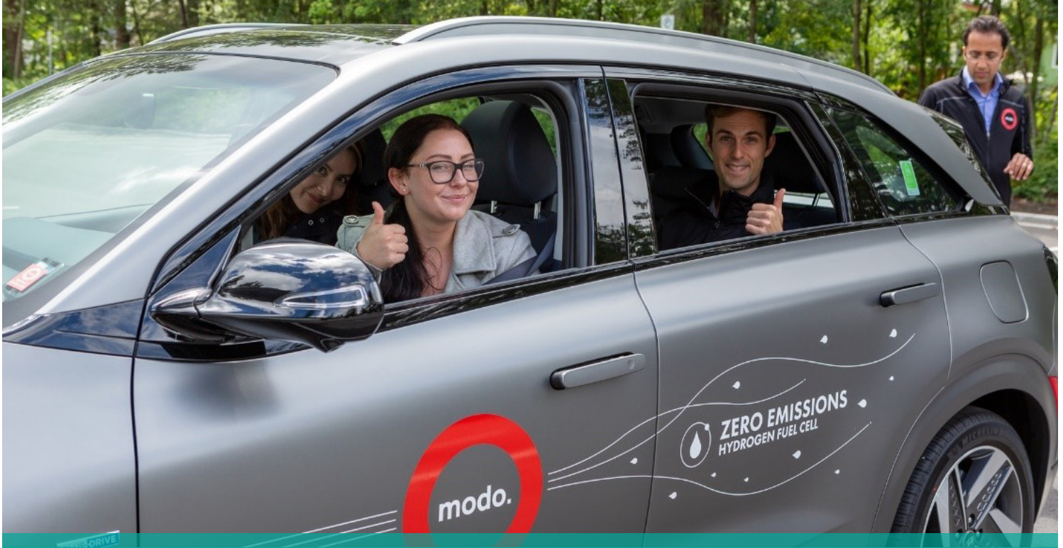
BC Housing staff learn about hydrogen fuel cell and electric vehicles at a livegreen event.