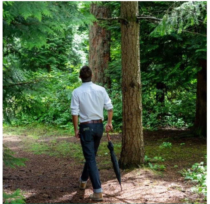
A BC Housing staff member observes nature at a livegreen council event.