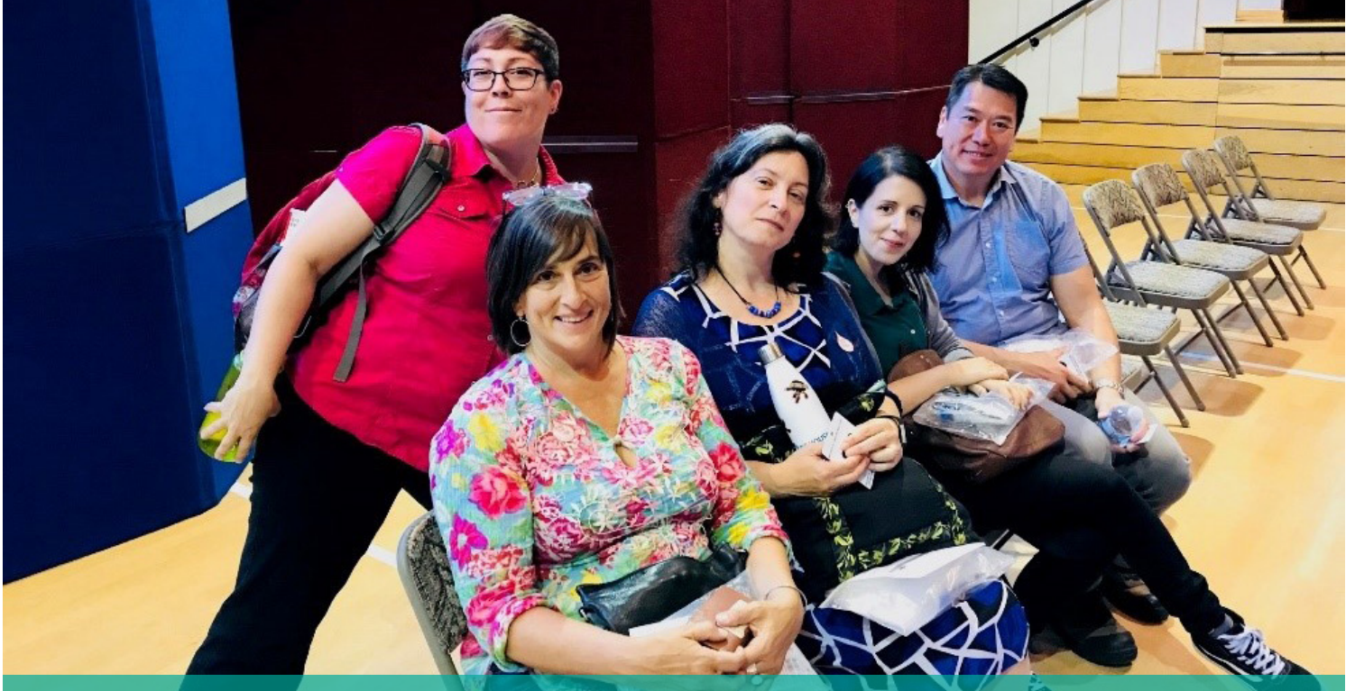
BC Housing staff donate blood for Canadian Blood Services.