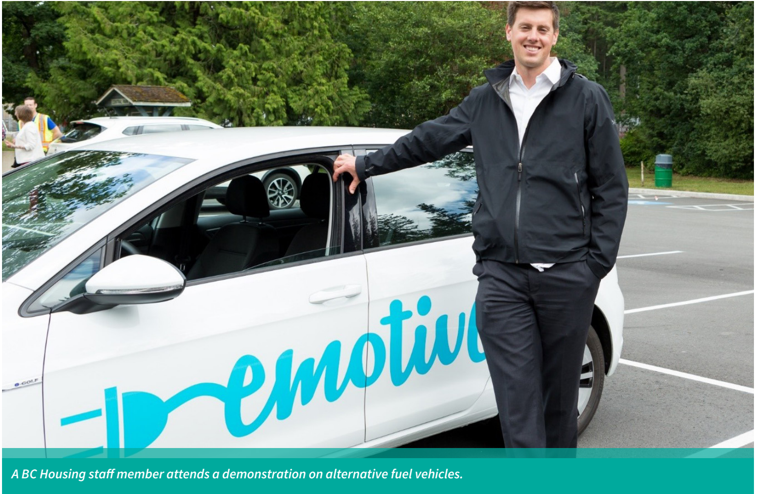
A BC Housing staff member attends a demonstration on alternative fuel vehicles.