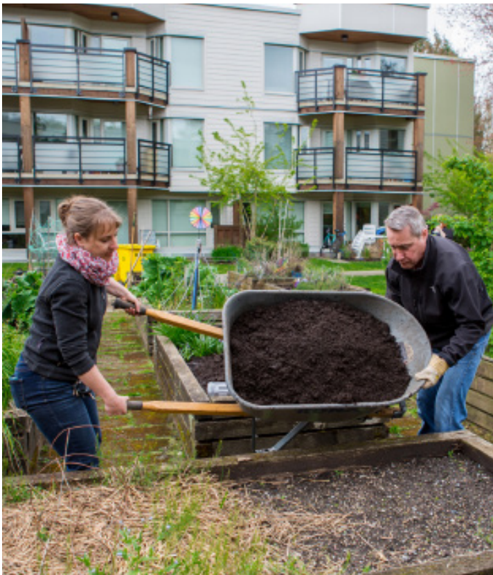
BC Housing staff volunteer with the People, Plants and Homes program.

Our livegreen Sustainability Report describes in detail our actions to date, including those highlighted below.