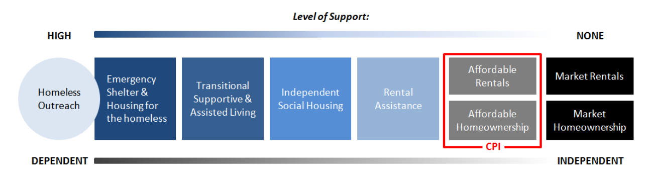
Figure 1: CPI within the Housing Continuum

Where projects involve supports or services to residents, additional funding from other programs and/or commitments from other funders will be necessary to ensure projects are viable.