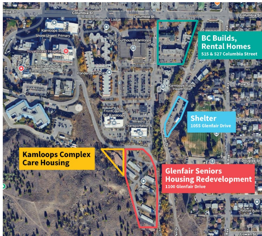
Figure 1 - Map of area known as the Columbia Precinct – BC Housing projects

Feedback collected during the engagement period will be used to support the integration of new housing into the community. We thank all project partners and community members for their participation.