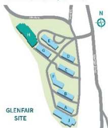
Current property (2025)