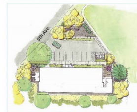
Architectural rendering of proposed Kamloops Complex Care