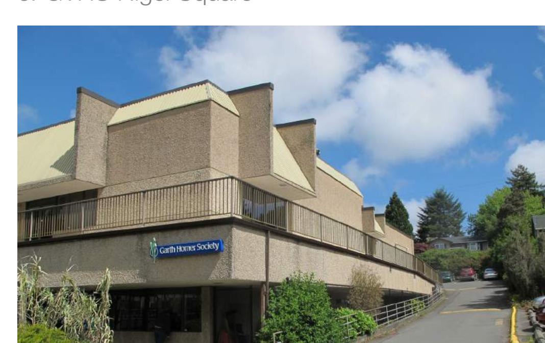
c. GVHS Nigel Square b. ICMH Newbridge Apartments