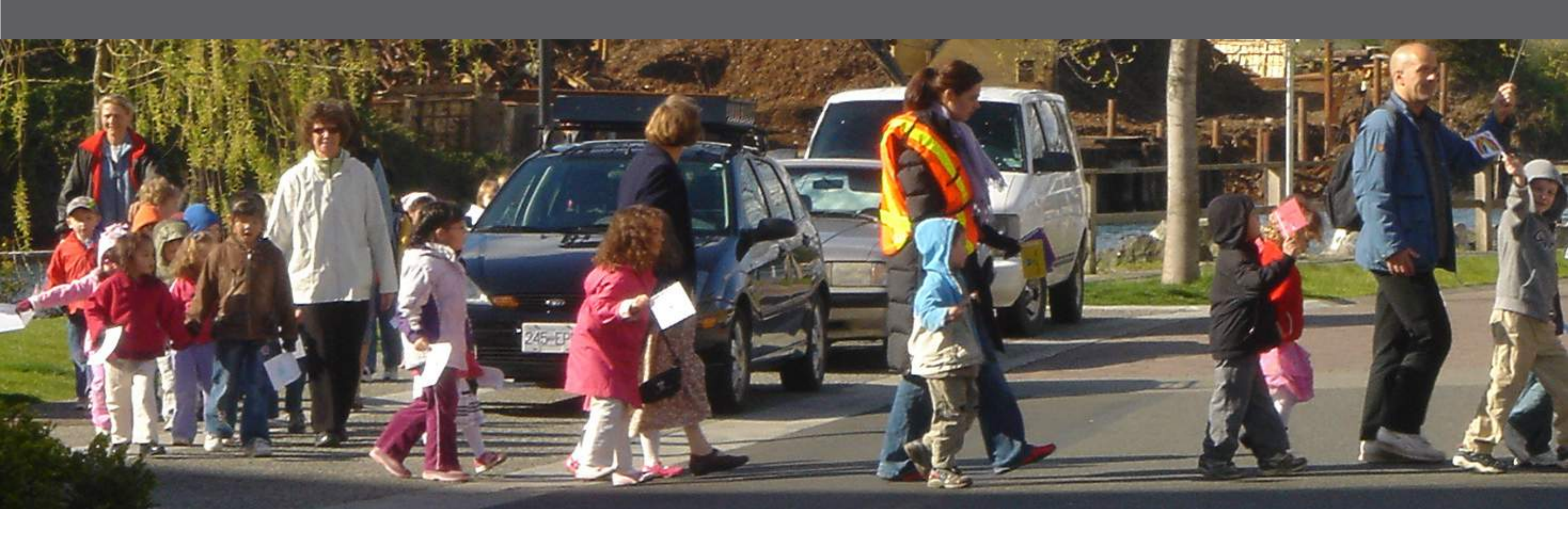
Nigel Valley Neighbourhood Plan

It takes a village to raise a child...it takes a neighbourhood to make a life.