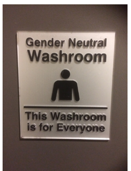
Figure 7: Example of gender neutral washroom signage, 3030 Gordon