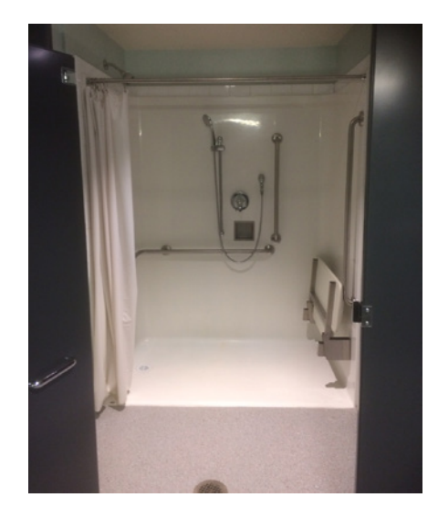
Figure 4: Example of roll-in shower, 3030 Gordon