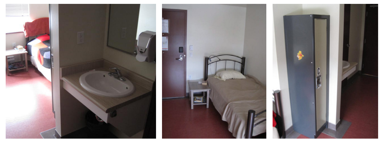
Figure 22: Example of women's 3-bed room with sink & lockers, Rock Bay Landing