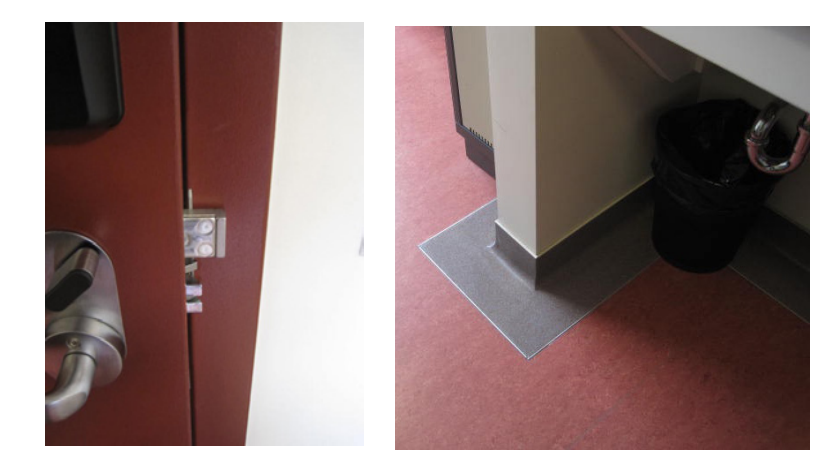
Figure 2: Examples of durable flooring & door hardware, Rock Bay Landing

Flooring materials that are durable and easy to maintain;