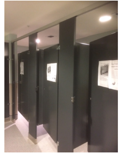
Figure 19: Example of toilet stalls, 3030 Gordon