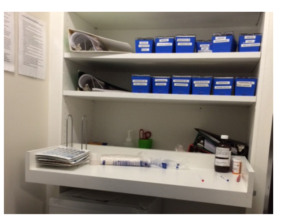
Figure 12: Example of medical supply storage, 3030 Gordon