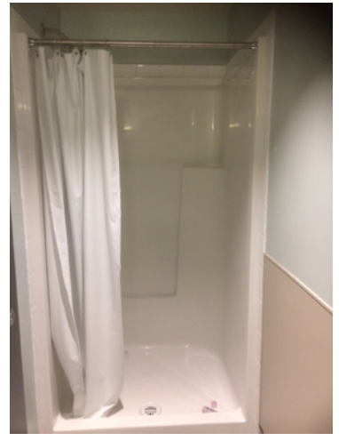
Figure 18: Example of a shower stall, 3030 Gordon