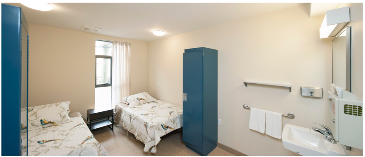
Figure 23: Example of women's 2-bed room with sink & lockers, Powell Place

The four-bed format can also be reconfigured as a three-bed layout that includes a shower and toilet, with a separate sink in the location of the fourth bed. The three and four-bed configurations offer the design opportunity for two rooms to be combined into a small apartment in the future. Shelters may also include one and two-bed configurations – one-bed spaces can accommodate individuals with couples, single parents with children, individuals with disruptive sleeping patterns, or other behavioral issues. The minimum required floor area for each bed space is 4.6 m<sup>2</sup> (50 sf).