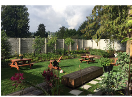
Figure 28: Example of outdoor space, 3030 Gordon

Where required by the operator, a common garden area can be provided for shelter residents to have the experience of planting and producing food, as well as for therapeutic effects.