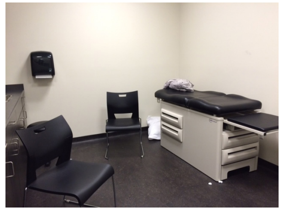
Figure 11: Example of medical room, 3030 Gordon

A ground floor space for visiting medical professionals should be a minimum of 14 m<sup>2</sup> (150 sf), and be equipped with an examination bed, lockable cabinet, small desk, washbasin, countertop, and paper towel dispenser. A second access is required to allow unimpeded exit from this room. For minimum barrier shelters, provide spaces for shelter users to access harm reduction supplies.