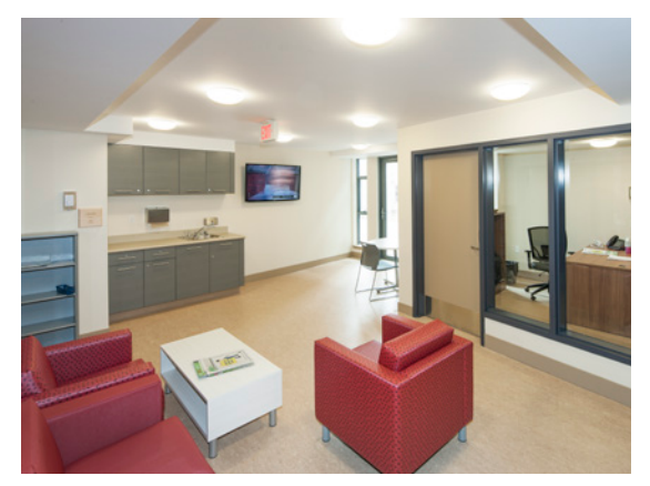
Figure 13: Example of case worker office, Powell Place

This space should anticipate the increasing age and potential mobility impairment of