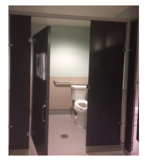
Figure 3: Example of accessible washroom, 3030 Gordon