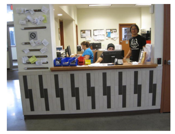
Figure 9: Example of reception area, Rock Bay Landing