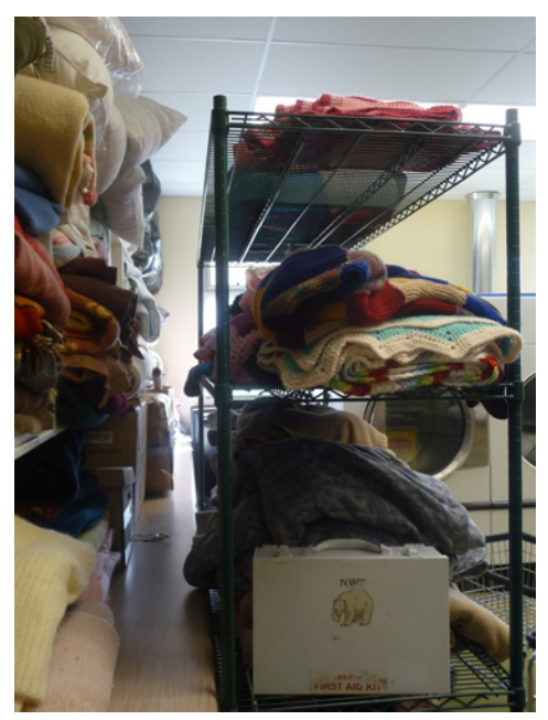
Figure 21: Example of donated clothing storage space, Rock Bay Landing