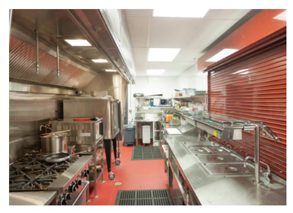
Figure 14: Example of commercial kitchen, Powell Place

Shelters should contain seating opportunities with two, four, and six-seat tables, and could include some high tops. Dining room seating should be sized to accommodate the capacity of the shelter in one sitting, but larger shelters may need to have multiple sittings. Provisions should be made for a small countertop area, and a microwave for shelter users to heat up food.