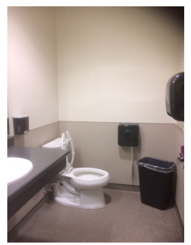
Figure 17: Example of individual washroom, 3030 Gordon