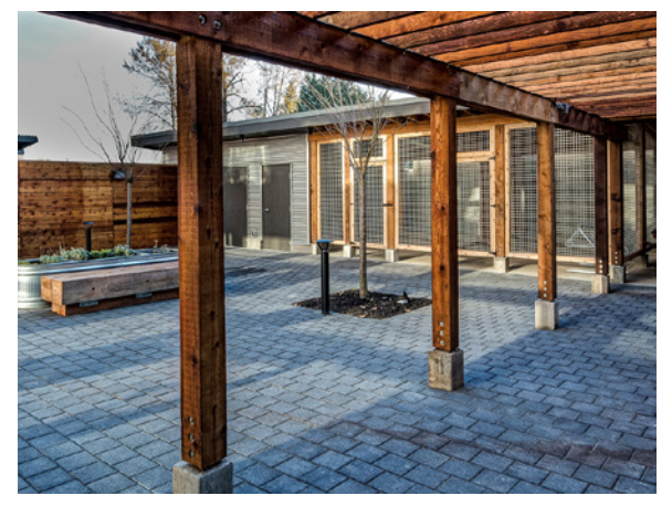
Figure 6: Example off-street area, 3030 Gordon Project