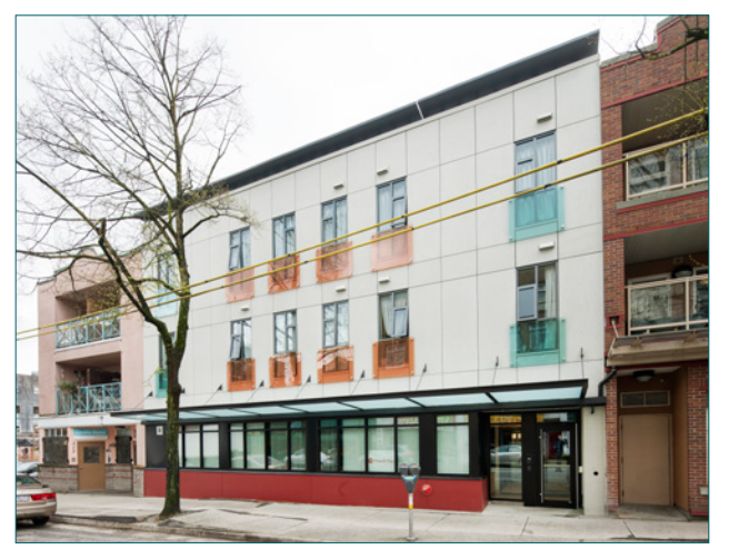
Figure 1: Powell Place, Vancouver. This 52-bed shelter involved a major renovation of an existing shelter.

housing continuum that helps people move from homelessness to permanent accommodation and, provide with supports as necessary. In considering the development of a new shelter, or upgrades to an existing one, reference should be made to the most current version of BC Housing's Emergency Shelter Program Framework , which also provides definitions for terms used in the planning and operations of shelters.