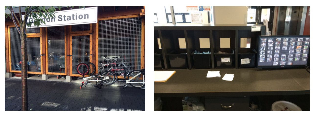
Figure 8: 3030 Gordon examples, left: outdoor storage, and right: harm reduction supply storage.