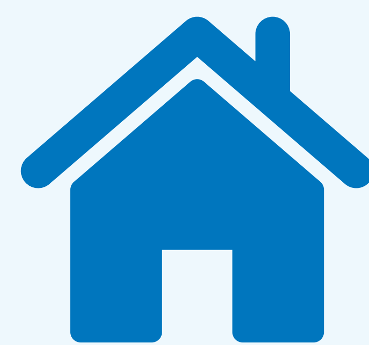
Harding Heights – 19 Units Affordable Housing for seniors and people with disabilities