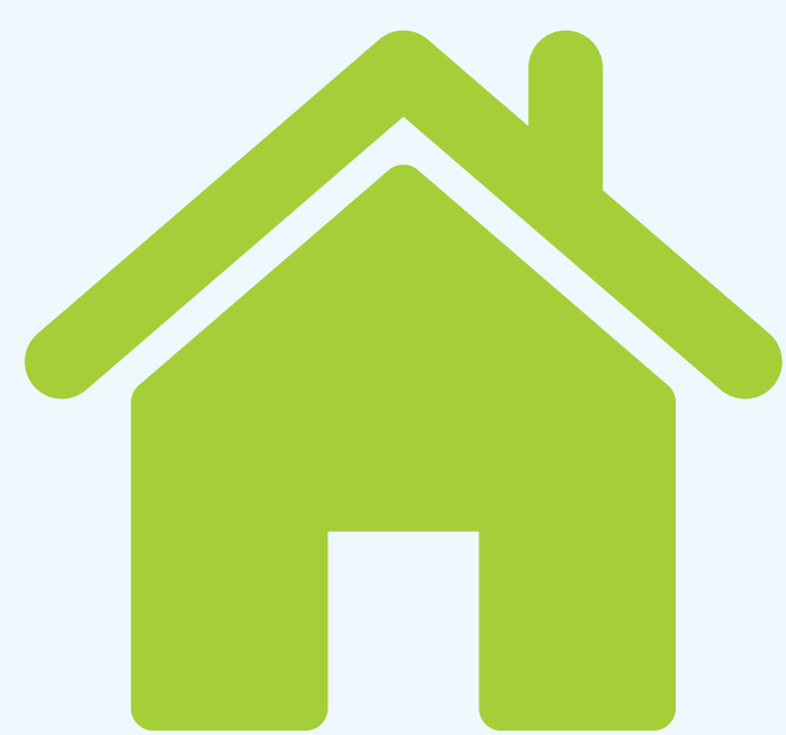
Alfred Avenue Project – 40 Units Supportive Housing