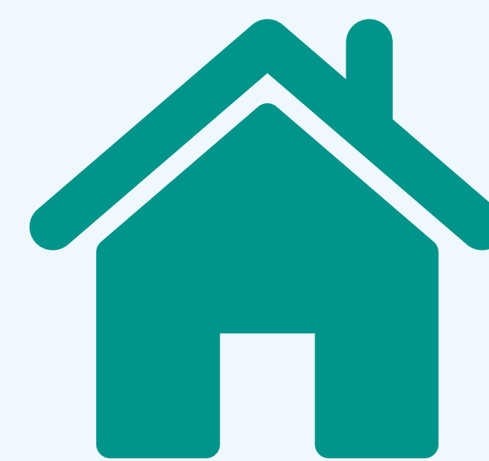
Indigenous Housing Fund Project – 37 Units Subsidized Rental Housing

BC Housing projects range from supportive housing to affordable housing, serving local people with varying income levels and needs.