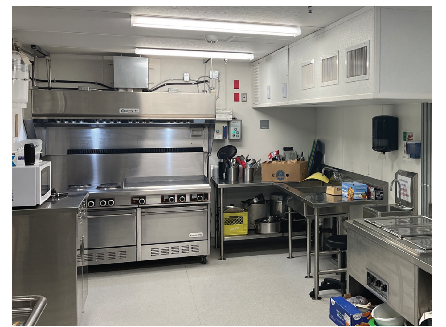
Supportive Housing at 3896 Railway Ave, Smithers