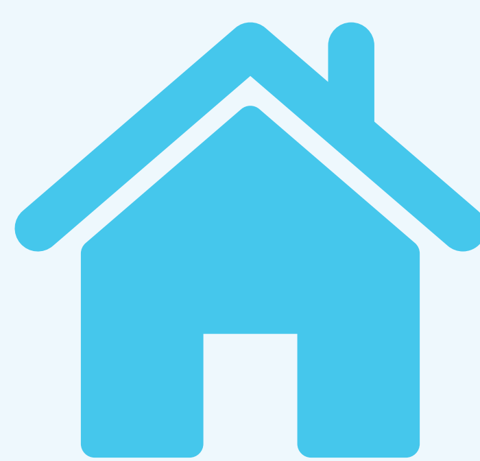
NSDP Women's Project – 12 Units Women's Transition Housing