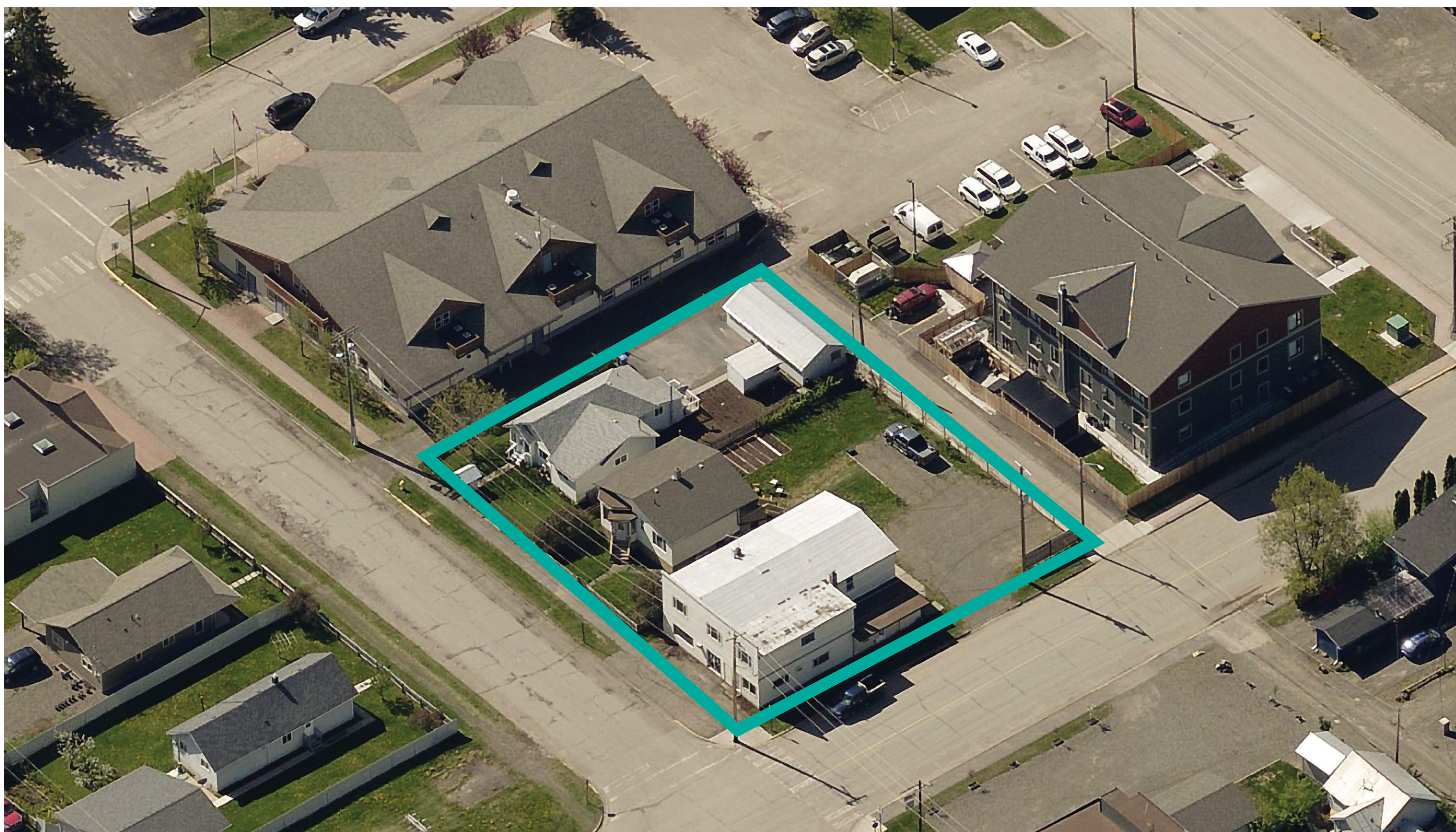
A bird's eye view of the site