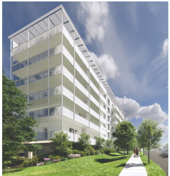
Figure 3. Rendering of Vienna House from Victoria Drive (source: PUBLIC Architecture).