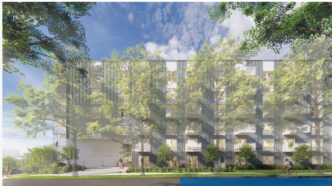
Figure 1. Rendering of Vienna House from Stainsbury Ave..

The seven-storey mass timber and lightwood frame hybrid building will provide 123 units ranging from studio to four bedrooms. It is an efficient mid-rise building type, with the potential for it to be recreated in B.C. and across Canada. The project has a counterpart housing project in the City of Vienna, Austria. This provides a unique opportunity to share knowledge and best practices in housing design. It will be subjected to acoustical and vibration testing prior to occupancy and will be monitored for ongoing environmental and structural performance.