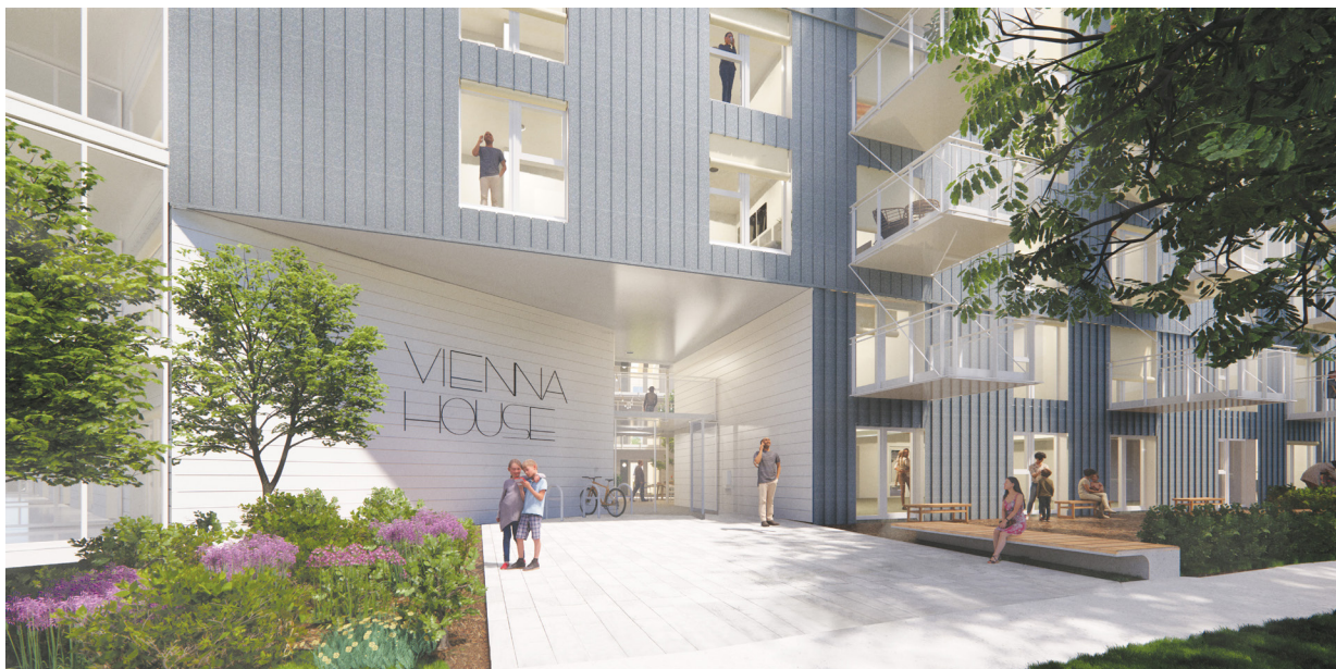
Figure 5. Rendering of Vienna House, entrance