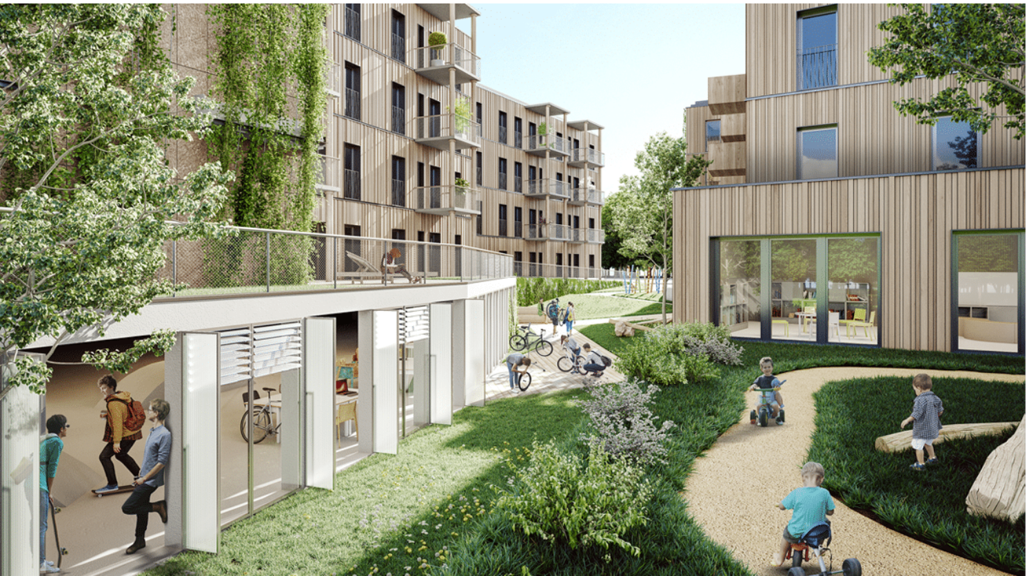
Figure 4. Rendering of Vancouver House in Vienna, Austria.