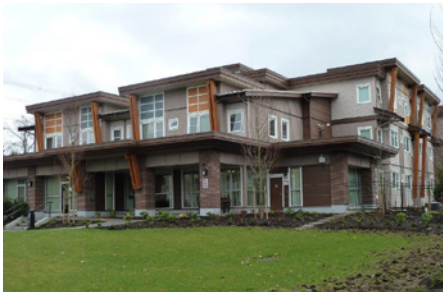
Timber Grove in Surrey (Coast Mental Health)

Opposition to the case study sites was mostly limited to the development phase. In all five case studies, neighbours stopped expressing concerns after a few months of the supportive housing sites becoming operational. Now all case study sites enjoy positive relationships with neighbours. Neighbours show support by dropping off donations, volunteering and attending events at the sites, making supportive housing residents welcome in their businesses, and in one case, advocating for additional supportive housing. Through several of the case studies, it was reported that the most vocal opponents to the sites became some of the biggest supporters once the sites were operational.