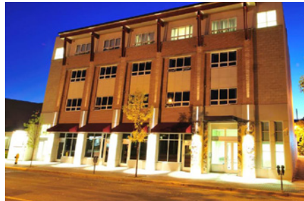
Cardington Apartments in Kelowna (John Howard Society of the Central and South Okanagan)