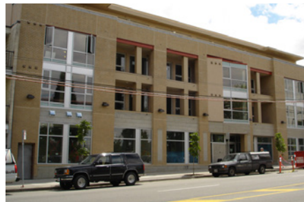
5616 Fraser Street in Vancouver (RainCity Housing)