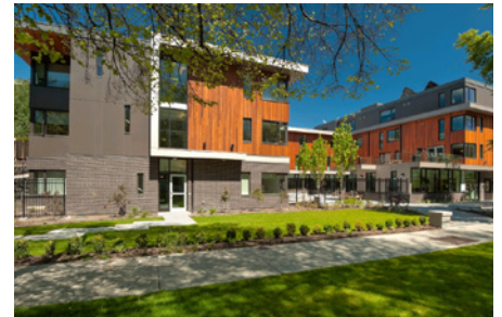
Camas Gardens in Victoria (Pacifica Housing)