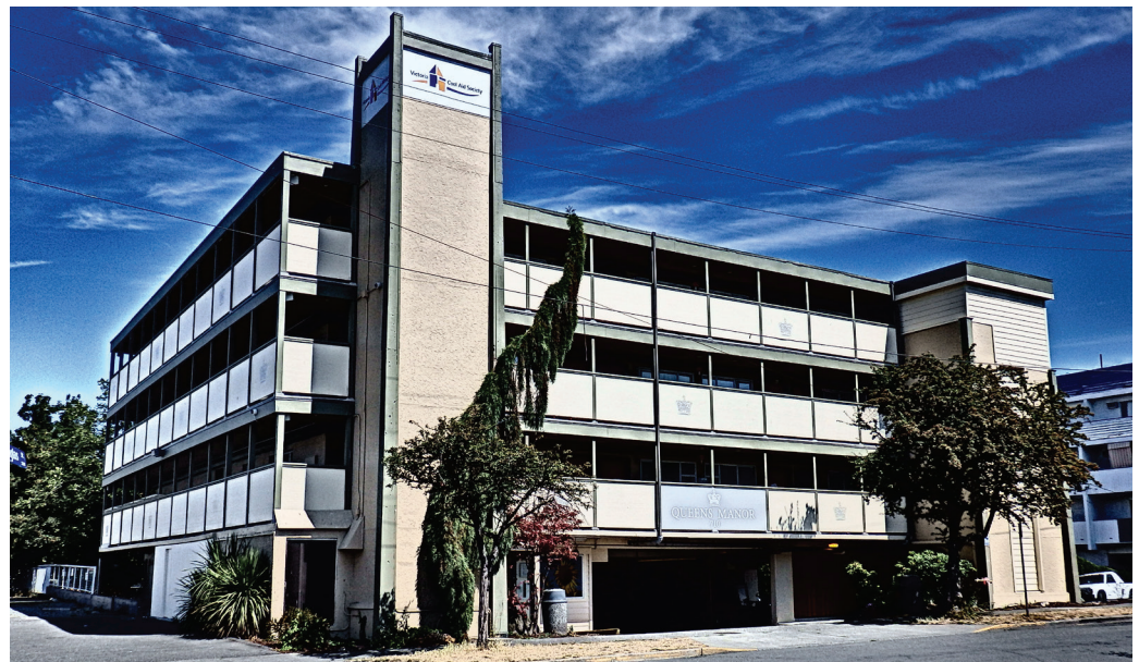
Queens Manor exterior

Supports available through Queens Manor are designed to help residents mitigate issues that may have led to homelessness in the past and work towards increased independence and stability. Program success in supporting stable housing is evidenced by the average length of stay of over two years. For individuals who have had difficulty maintaining housing, this stability enables significant movement towards positive outcomes.