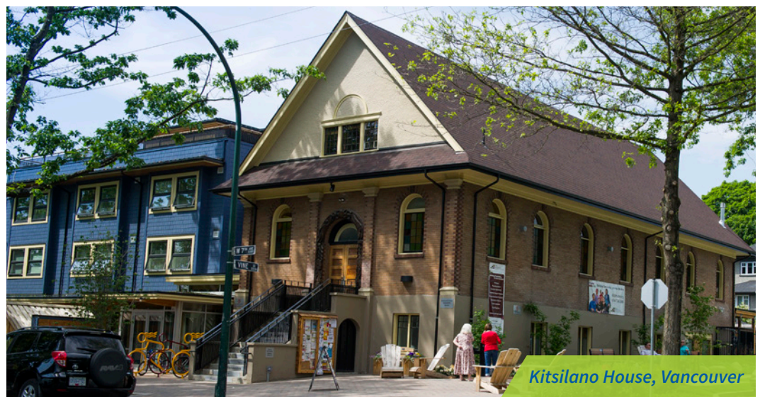
Kitsilano House, Vancouver