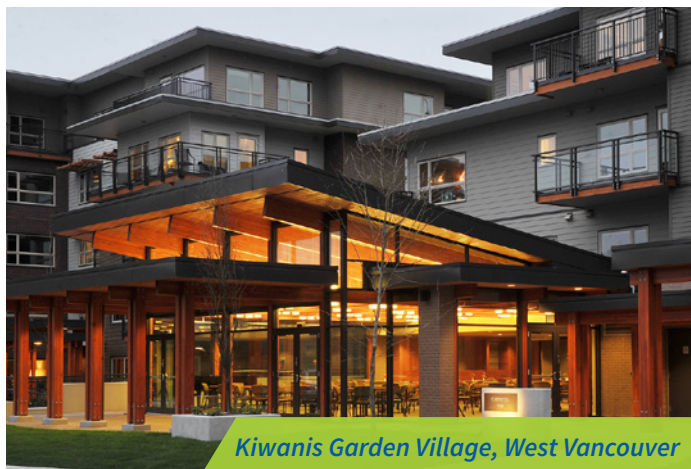
Kiwanis Garden Village, West Vancouver

Release: Don't expect the print, online, or broadcast media to use the text of your release. Often, the news release will be used as a starting point for journalists, who will cover the story differently or, perhaps, use your material as part of a larger story. Copies of the media release should be circulated within your organization and, if appropriate, to funding agencies, local government staff and councils and boards to keep them informed about the project. Consider also posting on your project website.