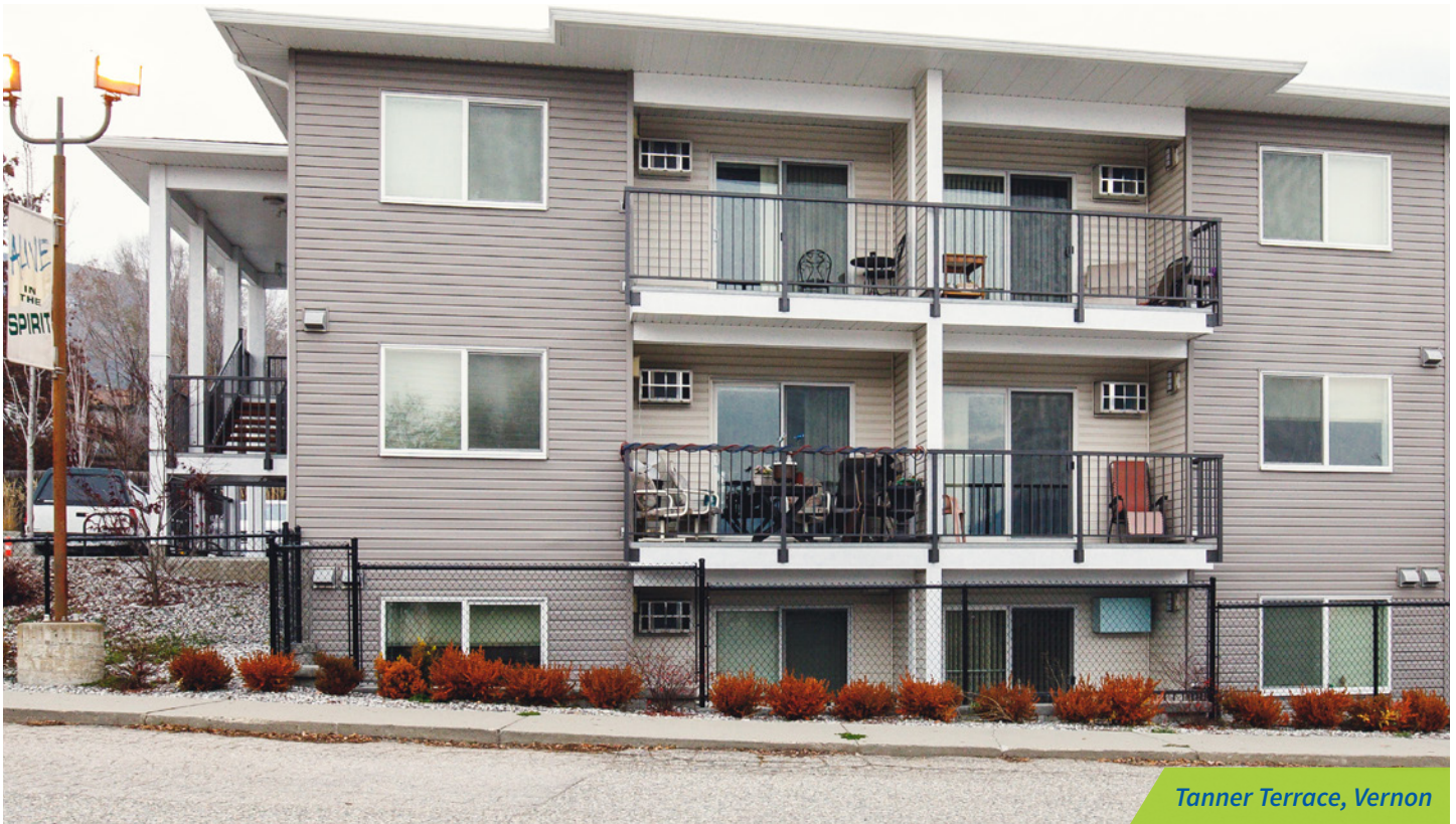
Tanner Terrace, Vernon