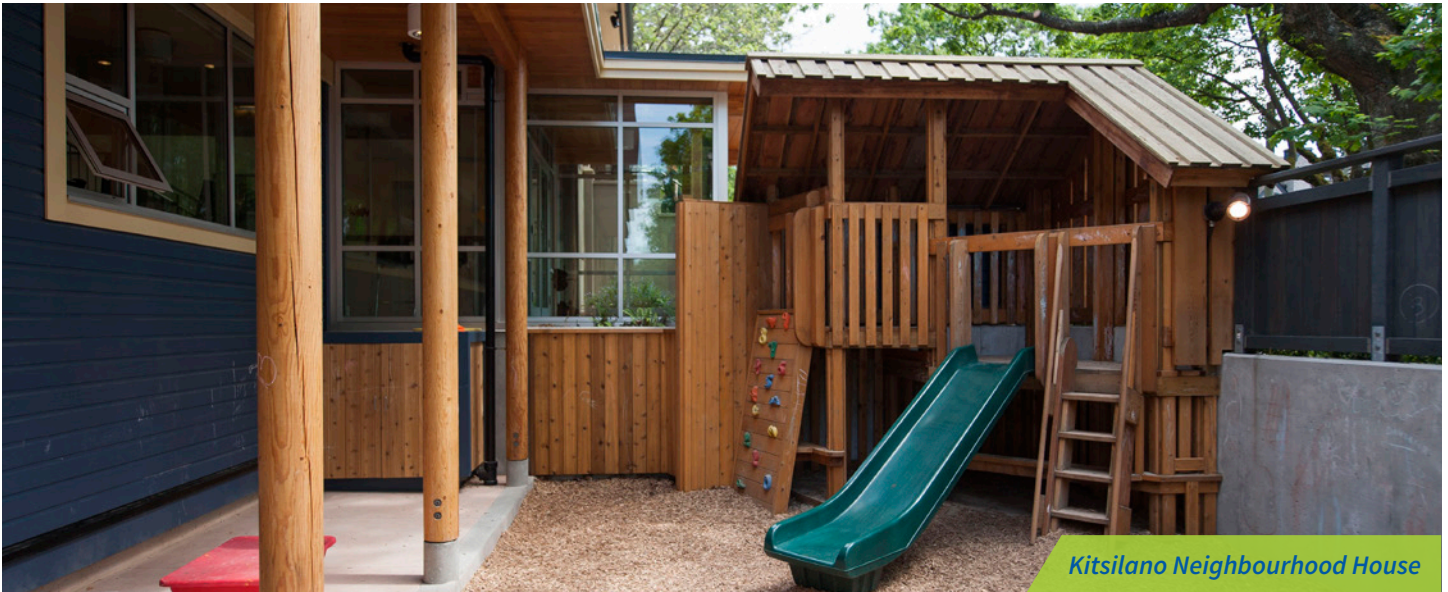
Kitsilano Neighbourhood House