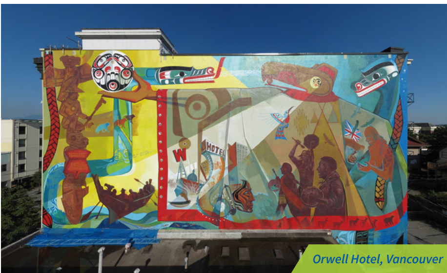
Orwell Hotel, Vancouver

Engage an architect with experience on similar projects early on to design