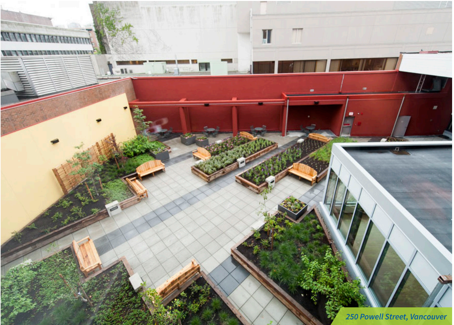
250 Powell Street, Vancouver