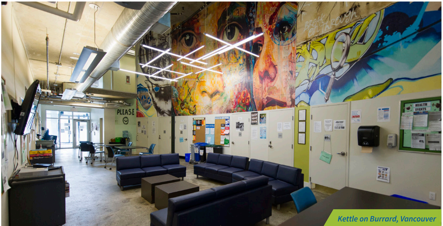
Kettle on Burrard, Vancouver