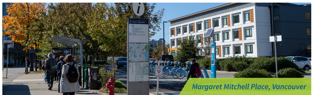
Margaret Mitchell Place, Vancouver