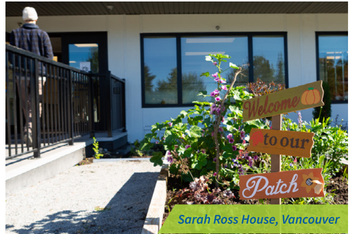
Sarah Ross House, Vancouver

The development should have signage that creates a sense of place. As a best practice, signage should also include the name of the sponsor and a contact telephone number. Including a contact number gives neighbours the ability to contact the non-profit housing provider to discuss their concerns. Another method of informing neighbours should be used when signs are not included. Crucially, the contact person must be responsive to neighbour concerns and available 24 hours a day. While this is an operational item, it will go far in creating a collegial and collaborative relationship between the housing development and the community.