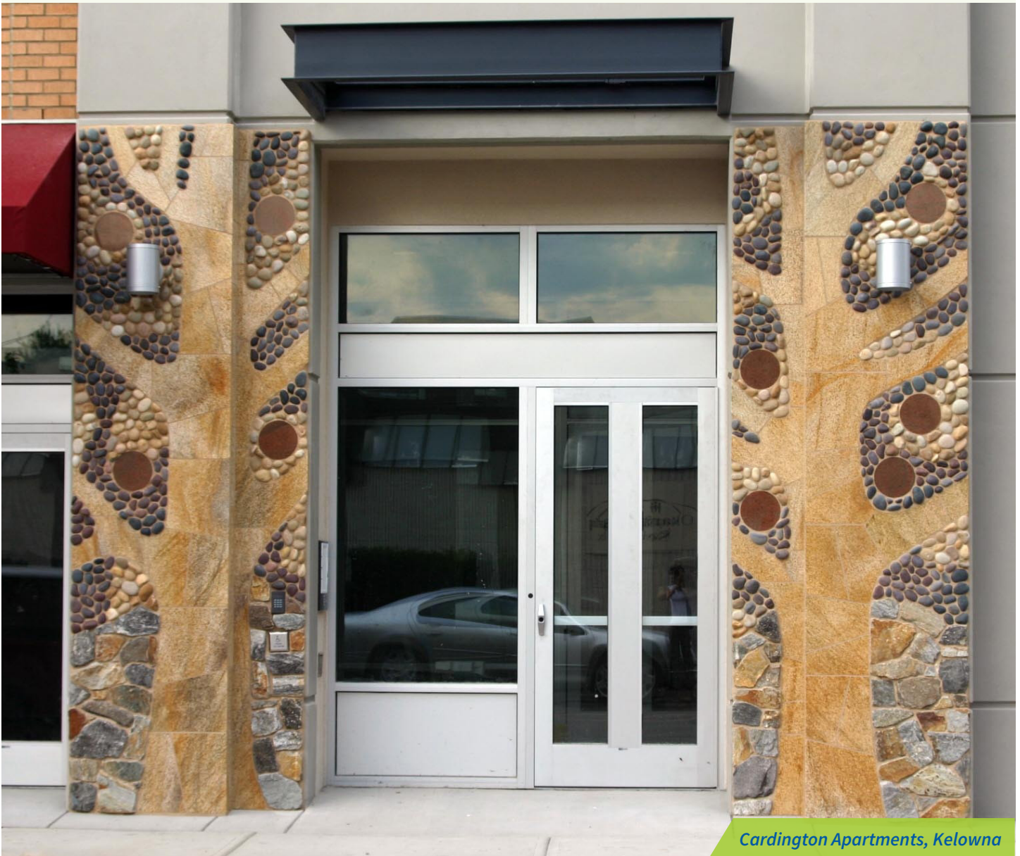
Cardington Apartments, Kelowna

Cardington Apartments in Kelowna is a supportive housing development for adults experiencing or at risk of homelessness, who are managing mental health and addiction challenges. Operated by the John Howard Society of the Central and South Okanagan (JHSCSO), the project opened in 2008 and was the first supportive housing site in the City of Kelowna. The development includes a social enterprise coffee shop and catering service located on the ground floor. This social enterprise partners with the JHSCSO to provide fresh local groceries and prepared food items and is popular with the community and residents alike. Cardington Apartments also has community art built into the entrance and has participated in local art tours. For more information, visit https://www.bchousing.org/research-centre/library/community-acceptance/bk-case-study-cardington&sortType=sortByDate .