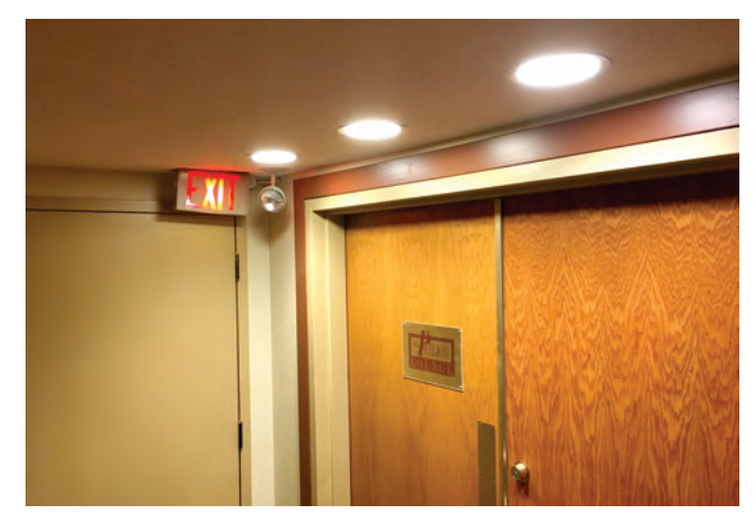
LED pot lights and old Exit signs

"The light emitted by the LED appears to have a nice brighter, cleaner, clearer appearance in every type of application and location."