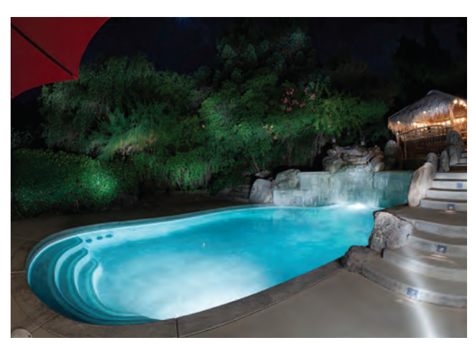
Good light levels in and around pools and hot tubs improves safety and security