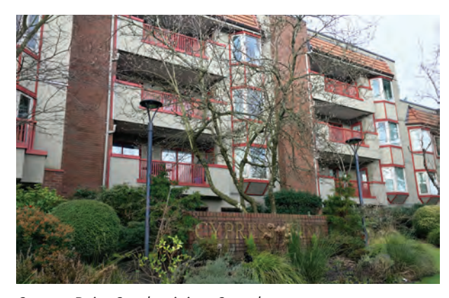
Cypress Point Condominium Complex

In the fall of 2015, the common-area lighting at the Cypress Point condominium complex in Richmond, B.C., was converted to LED lights. Cypress Point is three, 35-year-old buildings that include 106 suites, parking garages, a common lounge, games room, fitness room, change room with showers, sauna, racquetball court, seasonal outdoor pool, and outdoor hot tub. The lighting upgrade cost was under $30,000, and was recovered in two years from energy cost savings.