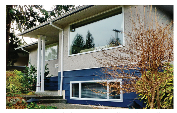
The upper windows on this home are protected by overhangs, allowing for more options when selecting products or evaluating installation methods.