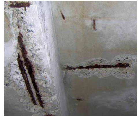
Corroding reinforcing steel and delaminated concrete