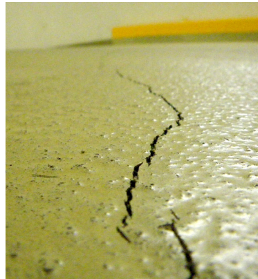
Cracks in a suspended concrete slab membrane