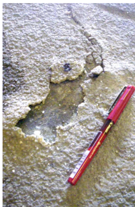
Delamination of suspended concrete slab membrane

The cost of performing maintenance to below-grade assemblies increases exponentially the longer it is deferred. When addressed early, the costs for maintenance may be limited to reducing water infiltration, whereas deferred maintenance may include expensive concrete repairs in addition to controlling the water infiltration.