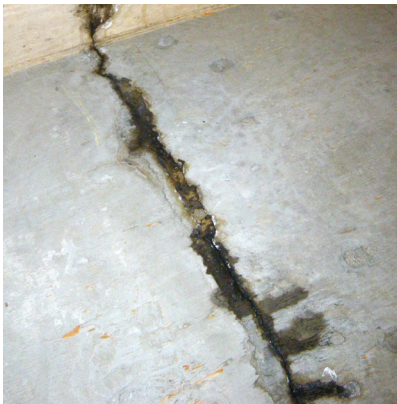
Water ingress through a crack in the concrete slab

In practice, there are no waterproofing systems with life expectancies that ensure performance over the entire life of a modern building. As the membranes age, the combination of membrane and concrete performs as a two-stage system with a primary layer consisting of the membrane, and a secondary layer of reinforced concrete and waterstops. Both of these layers can be reasonably water resistant. Together, these layers provide some