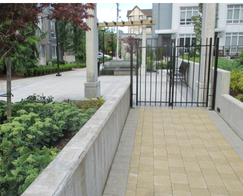
Above the podium

Failures of podium waterproofing regularly cause leaks and water damage. Similar to roofs, podiums must be waterproofed to prevent water exposure damage to the structure, interior finishes or property below.