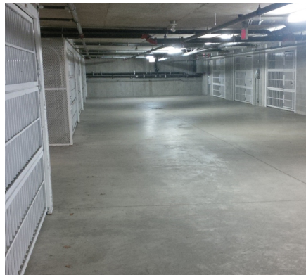
Below the podium