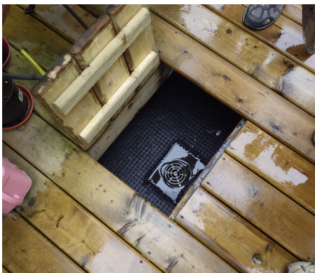
Wood decking with accessible membrane