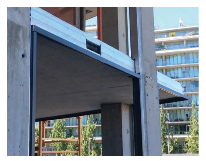
Waterproofing at the edge of the floor at the by-pass panel area

permit is delivered the design package will be issued for construction. Construction will start on the building, starting with mobilization, demolition, and installation. The contractor or construction manager develops a construction schedule and coordinates the work on site between trades.