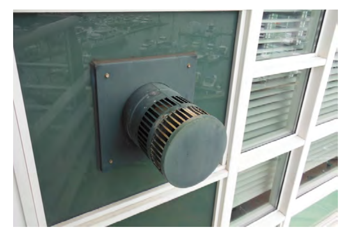
Fireplace vent penetration through a spandrel panel

Once code requirements are satisfied, the strata will be presented with several options: