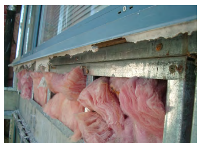
Corroded screws in stud wall beneath window